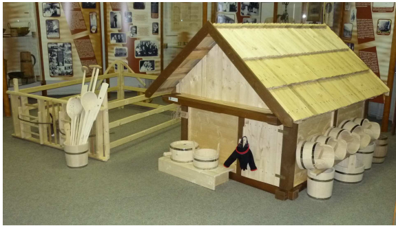
Exhibition in Podpoľanie Museum

Welcome in Podpoľanie Museum, which was established by Detva Municipality in 1994. It has a seat at Partizánska Street No. 63 in the historic town center.